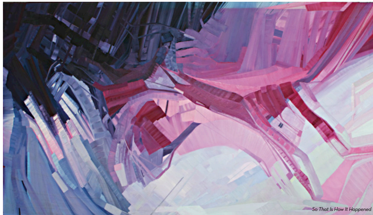
So That Is How It Happened

They're pushing the envelope with every stroke, and showing the world what they're made of. Verve highlights the works of several artists from the Subcontinent who are garnering acclaim all over the globe