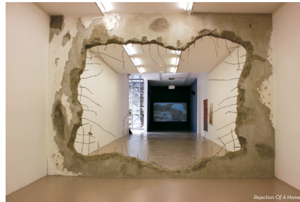
Rejection Of A Home