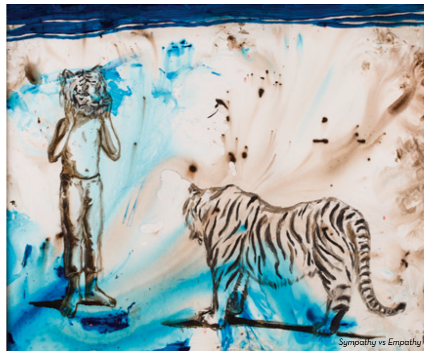
Sympathy vs Empathy