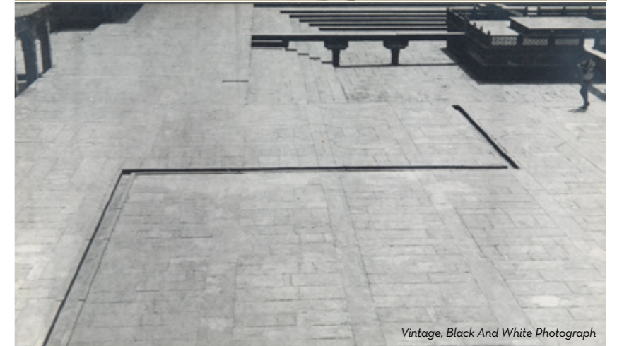
Vintage, Black And White Photograph

Nasreen Mohamedi: Waiting Is A Part Of Intense Living is on display at the Reina Sofia museum, Madrid until January 11, 2016.